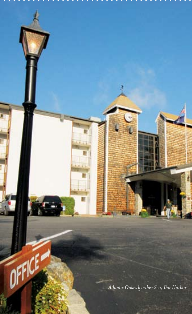
Atlantic Oakes by-the-Sea, Bar Harbor